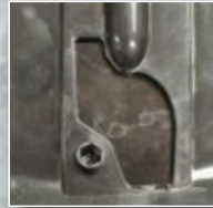
Adjustable Slide Gate Large adjustable opening for spreading a broad range of product