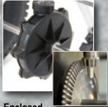
Enclosed Metal Gears Designed for heavy use