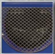
Grate & Rain Cover Included