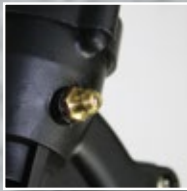
Grease Fitting Easy-access grease fitting to keep gearbox lubricated (82108B)