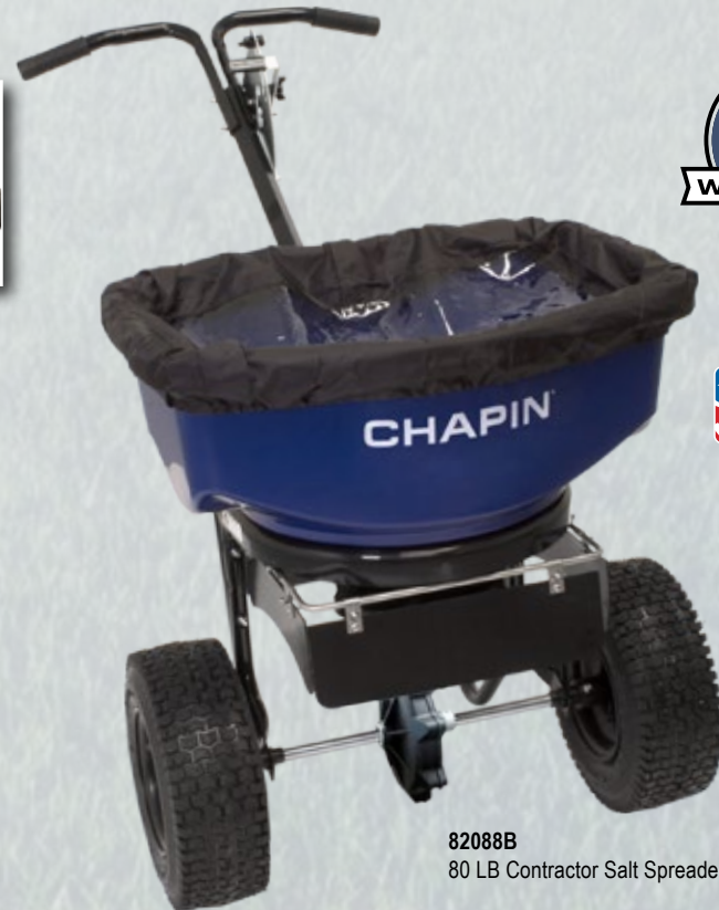
82088B 80 LB Contractor Salt Spreader