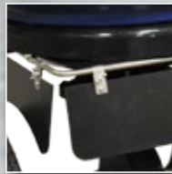
Adjustable Front and Side Baffles For directional control of spread pattern