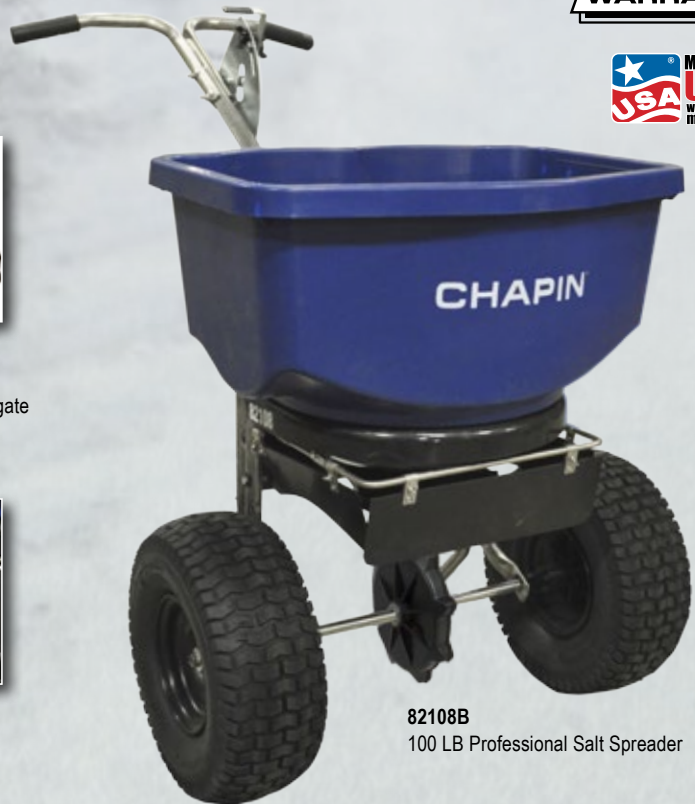
82108B 100 LB Professional Salt Spreader