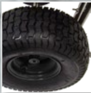
Wide Tread Pneumatic Tires Heavy duty for professional use 82108B - 14 in. 82088B - 12 in.