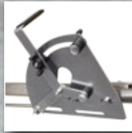
Solid Steel Linkage With Gate Control Opens and closes the gate in incremental steps