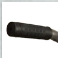
T-Handle With Rubber Grips Heavy duty for professional use