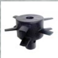
Auger Aggressive spike pattern tears up clumps