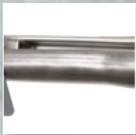
Stainless Steel Frame For maximum hopper support and corrosion resistance (82088B - Black Powder Coated Steel)